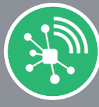
Radars & Sensors