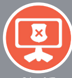
Cyber & IT Solutions