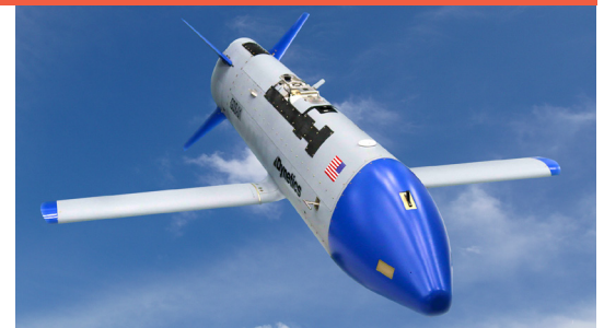
X-61A Gremlin Air Vehicle

Designed for reuse of expensive payload and propulsion systems with replacement of low cost airframe and other systems at end-of-life